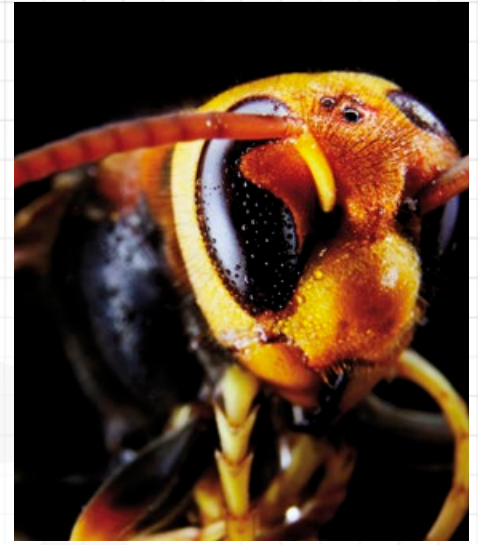
Close up of the face of an Asian hornet