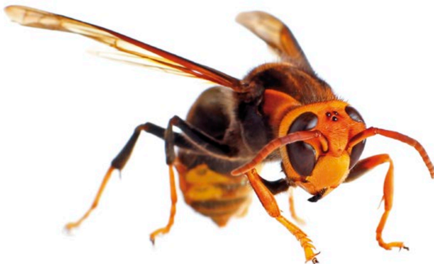
Dark bodied and dark legged apart from the tips which are lighter in colour