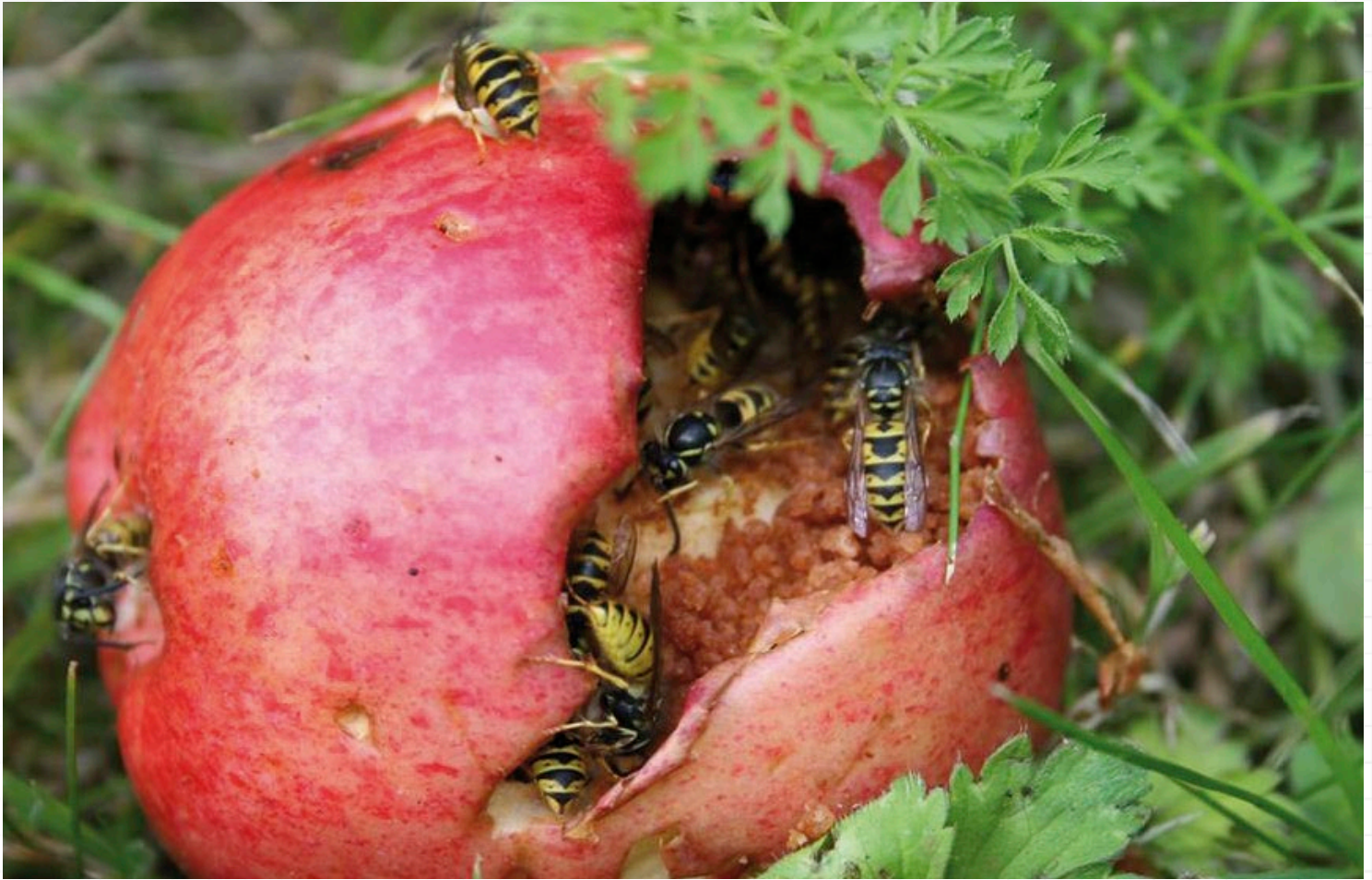
The common wasp ( Vespa vulgaris ) is much smaller than the Asian hornet - o. Duffy