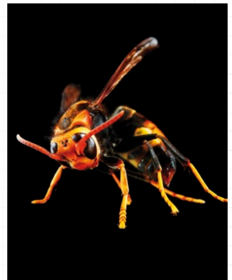
Asian hornet showing its dark legs with yellow tips